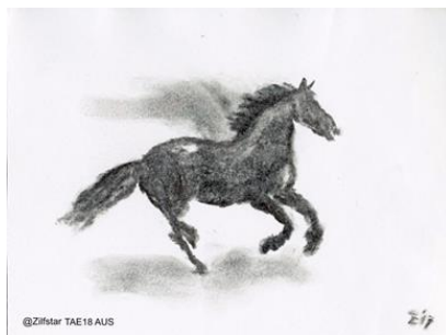
@Zilstar 'The Netherlands'