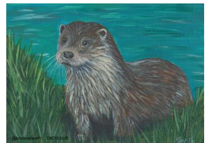
@Kirstensneath1 'River Otter' postcard