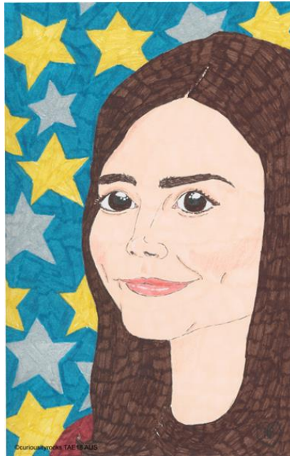
@curiosityrocks 'Oh My Stars' postcard

Be ready! It is a 'first in, first served' basis so make sure you are there for this unique original postcard art exhibition to open so that you don't miss out! For more information about this exciting art exhibition, please visit our website: www.pegasusact.com.au/upcoming-events