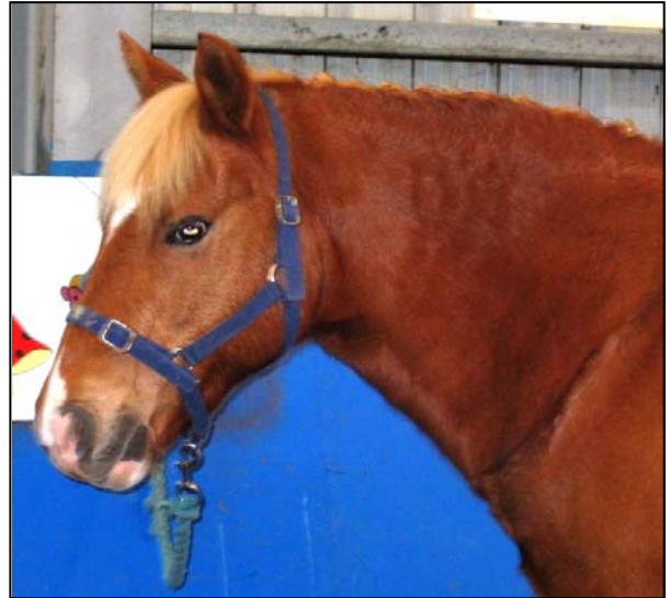
Trial pony, Wizard, during the recent School Holiday Program

Wizard has been here at Pegasus on trial for a number of weeks. He is a 13hh chestnut pony with a flaxen mane and tail and white star. He is 17 years old, been a pony club pony, but is also broken to harness. So far he seems unflappable and we are keen to have him vet checked and then hopefully purchase him.