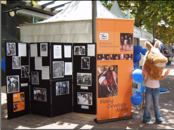
Smiley at the Multicultural Festival in February