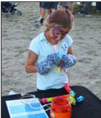
Trying out one of the Smiley Tent activities at the Charny Carnival