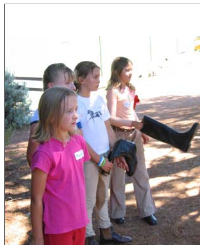
Preparing for the Gum Boot Toss