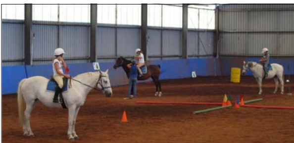
Playing the Monte Carlo game.