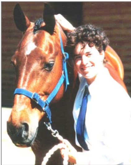
"Mister, thank you!"

Mister was an example of how much an educated horse of the right temperament can give to our riders. He knew what he was doing and was happy to oblige when his riders learnt to ask him correctly, and he was utterly patient and reliable while they were learning. A horse like this is possibly one that you only come across once in a life time. The number of riders that Mister introduced to the skills riding is countless. We will miss him very much and will be forever grateful that we were lucky enough to have him work with us for so many years.