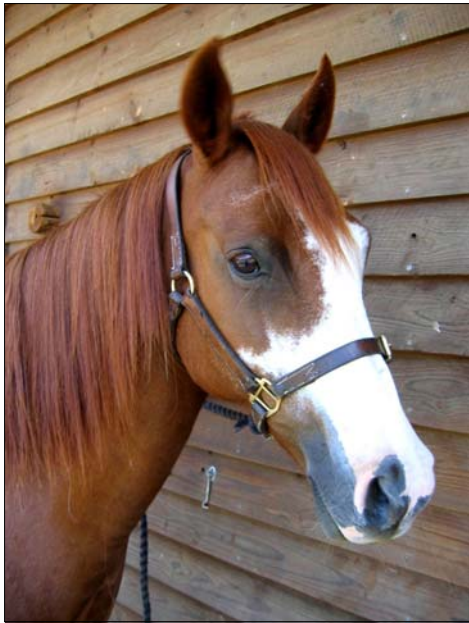
Radish was purchased from funds raised by 666ABC Canberra.

We are also very happy to announce that we have finally spent the money raised last year at the 666ABC Canberra trivia night to purchase Hahn, a 14 hand high chestnut part arab gelding. He is quite a handsome horse with a big white blaze down his face and four white sox. His coat has a reddish tinge, which is quite fortunate given that the winning team at the trivia night won the right to name the horse that we bought – they chose the name Radish. So, as well as getting used to his new environment, Hahn is also getting used to his new name!