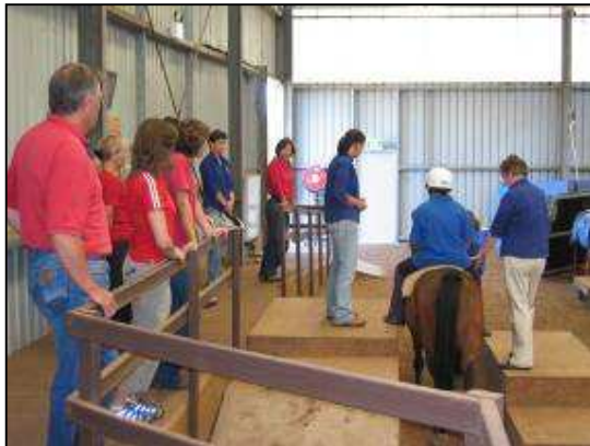
New volunteers learning about our mounting procedures.

Since February this year we have had several orientation and training sessions for new volunteers. So...welcome to all our new volunteers and welcome back to all our continuing volunteers. All of us at Pegasus – riders, horses and staff – value your contribution. Without you, the show would not go on!