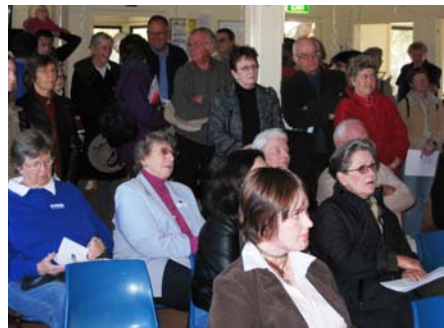
Spot the politicians amongst the crowd at the launch of the Pegasus Foundation

The Pegasus Foundation was officially launched at an event at Pegasus late in August. About 60 supporters came to the event, including many local politicians, to learn about the Foundation and its aims.