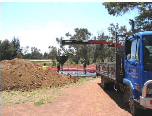
140,000litre water tank being poured

Needless to say, we hope that we will never have to put the emergency plan into action!