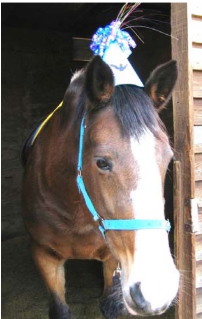
Spinner is obviously more of a party girl!!!